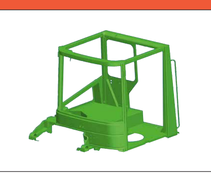
All-steel cab structure (FOPS and ROPS tested)