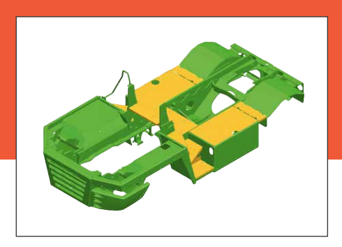
The fully welded chassis is a perfect combination of strength, weight and easy access