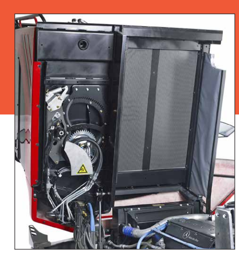
Standard feature: sound insulation material to ensure low noise level